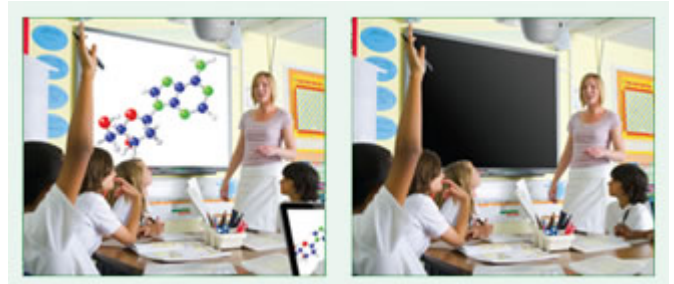
Eco AV mute off 100% power consumption

Stay in control of your presentation with the Eco AV mute feature. Direct your audience's attention away from the screen by blanking the image when no longer needed. This also instantly reduces the power consumption to 30%, further prolonging the life of your lamp.