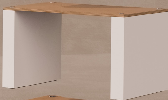
Stax 2G Shelf LP