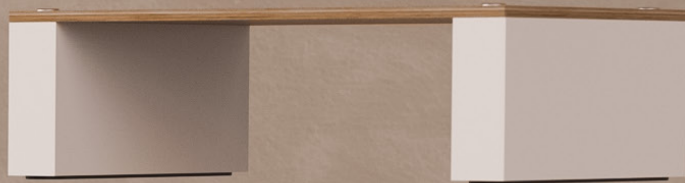
Stax 2G Shelf 170