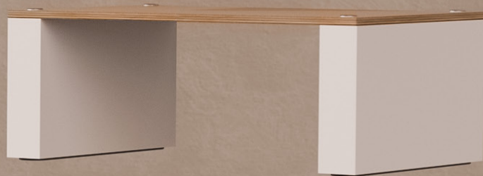
Stax 2G Shelf 220