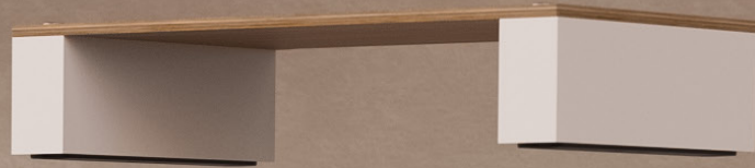
Stax 2G Shelf 120